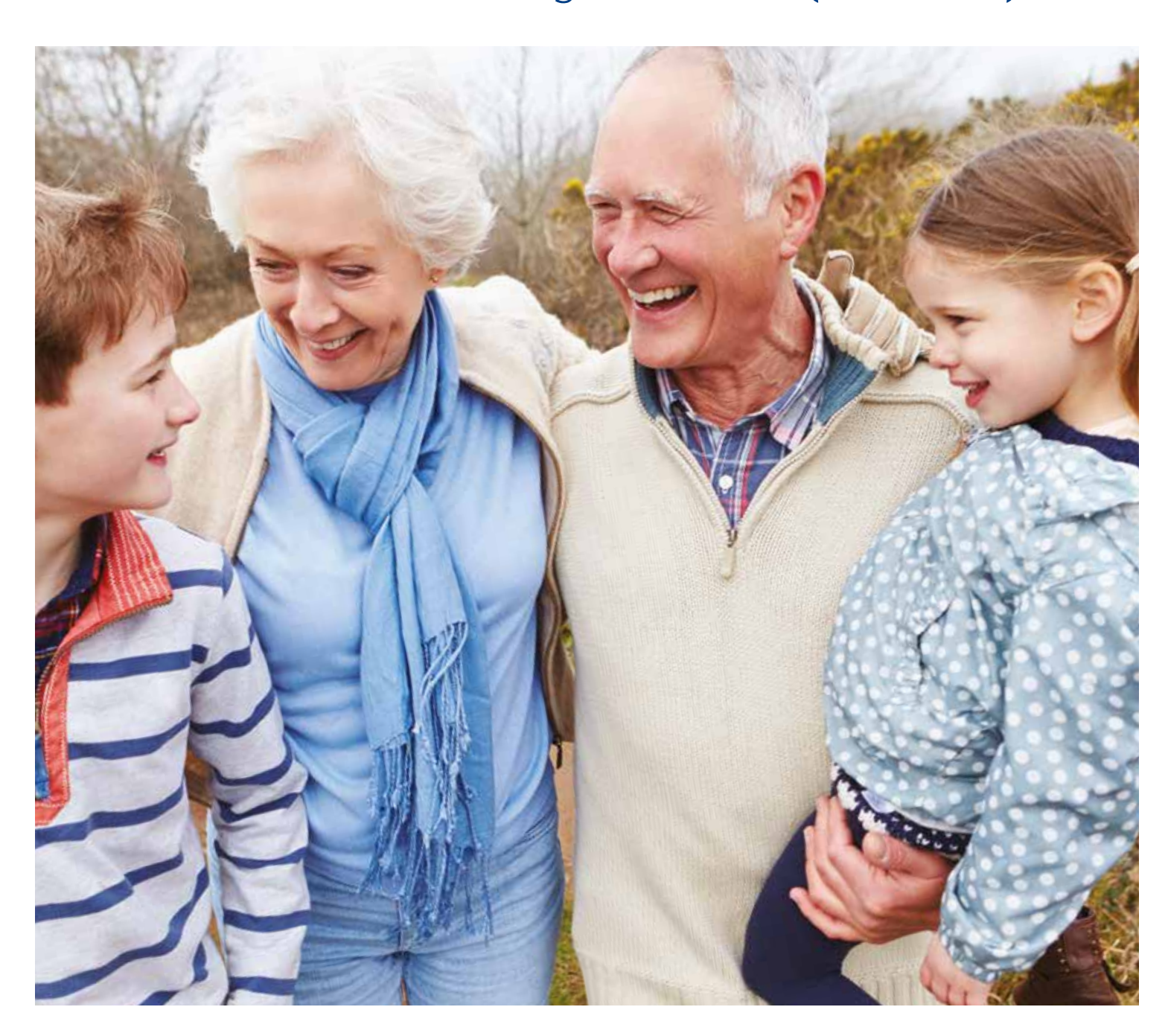
CARE • SUPPORT • ADVOCATE