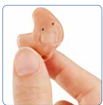
Full Shell ITE

and usually visible at the entrance to the ear canal.